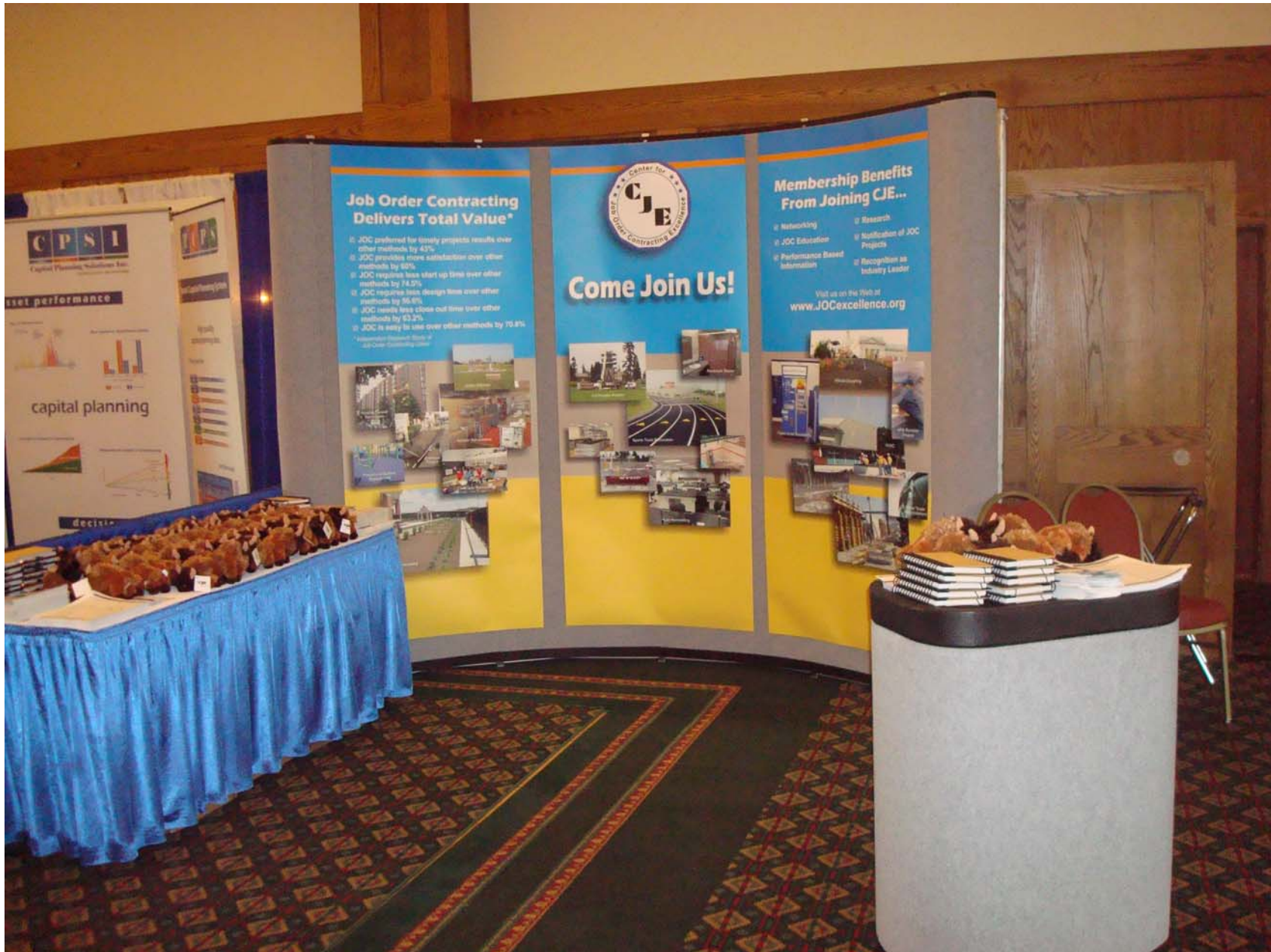
CJE Booth – Good Location Near Food