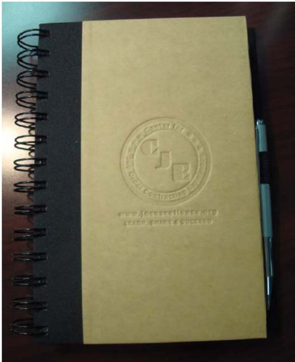
5 X 7 Note Book & Pen