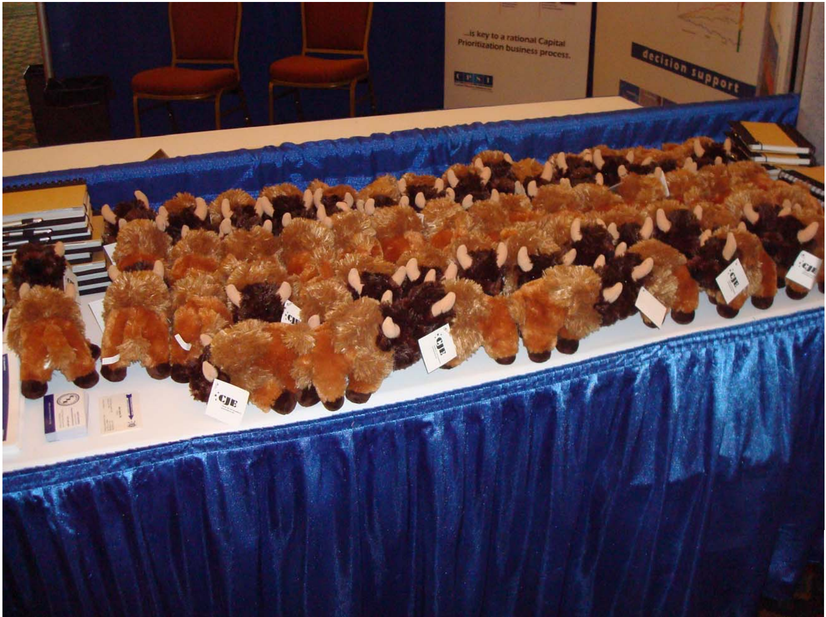
Hit Of The Show CJE Give Away Item – Benny The Buffalo