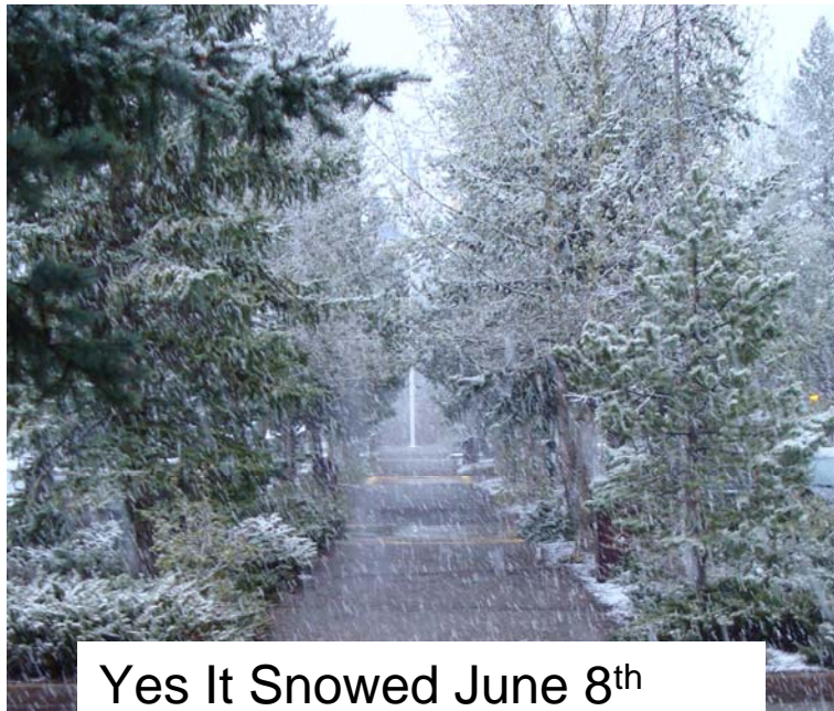
Yes It Snowed June 8 th